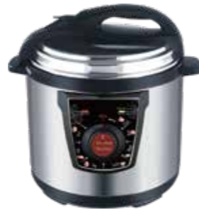
HH-B501/HH-B601 5L 900W/ 6L 1000W