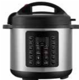
HH-A515/HH-A615 5L 900W/ 6L 1000W