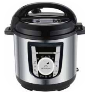
HH-B517/HH-B617 5L 900W/ 6L 1000W