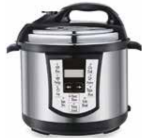
HH-A402/HH-A502/HH-A602 4L 800W/5L 900W/6L 1000W