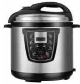
HH-A501/HH-A601 5L 900W/ 6L 1000W