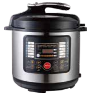
HH-A519/HH-A619 5L 900W/ 6L 1000W